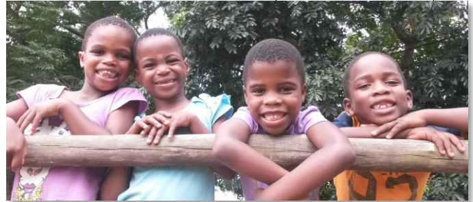
These four champions graduated from our preschool and are going to grade R at MCA next year