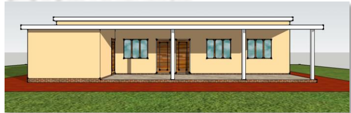
What our new preschool building will look like