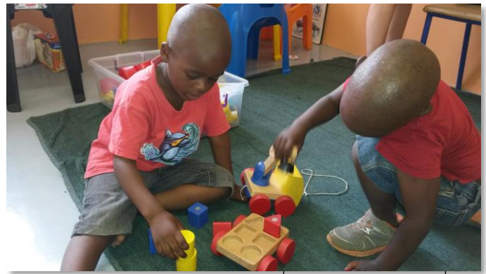
Happily playing with educational toys